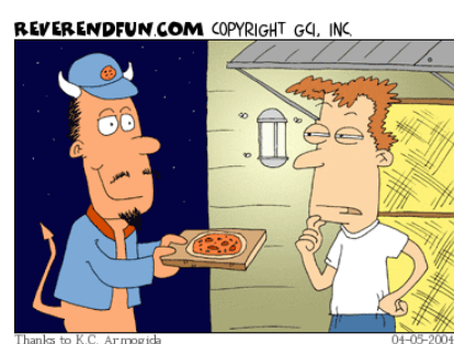
MY SOUL, YOU SAY ... CAN I GET DELUXE?

The penitential season of Lent is the period of forty weekdays - in imitation of