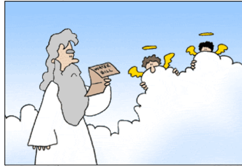
(See Genesis 6-8) 09-26-200

THE ANGELS HAD BEEN KEEPING THEIR DISTANCE EVER SINCE THE FLOOD BECAUSE THEY KNEW THIS WAS COMING...THE WATER BILL