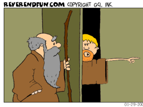
I'M SORRY, SIR - THIS IS A NON-PROPHET CORPORATION

Any choice or decision implies a variety of options of which one wins out. Daily we make hundreds of decisions, actual choices, that form the fabric of our life against the backdrop of eternity.