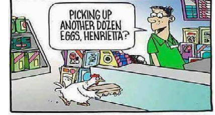
... and that is WHY the chicken crossed the road.