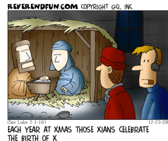
EACH YEAR AT XMAS THOSE XIANS CELEBRATE THE BIRTH OF X

When asked why she had such a long password, the employee rolled her eyes and said: "Hellooo! It has to have at least eight characters and include at least one capital."